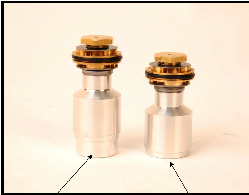
2004+ Race Tech Complete Compression Valve Assembly Kit FMGV S2057C (Long Base)